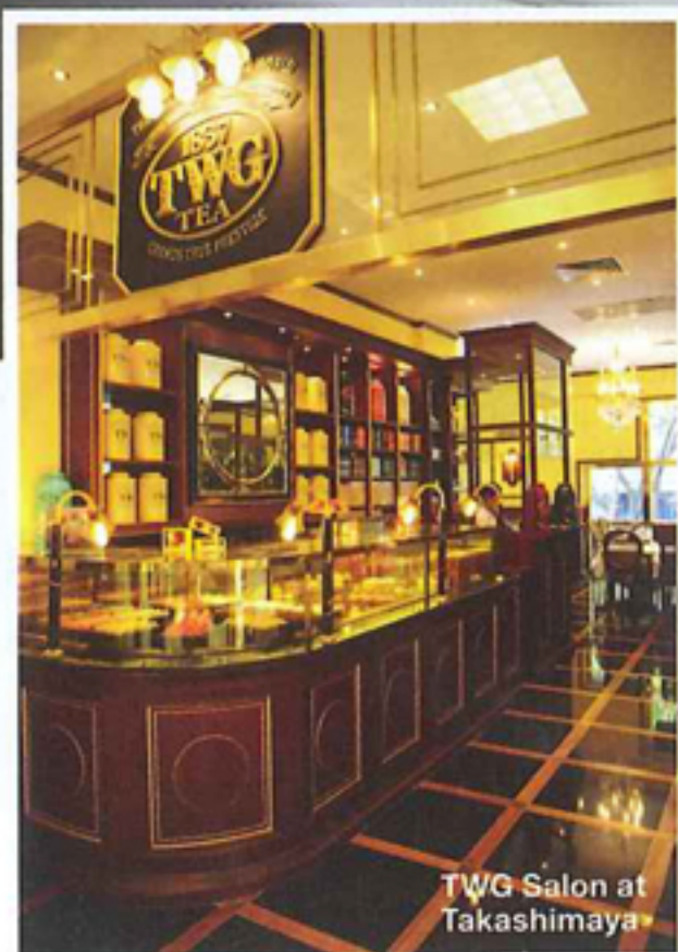
TWG Salon at Takashimaya