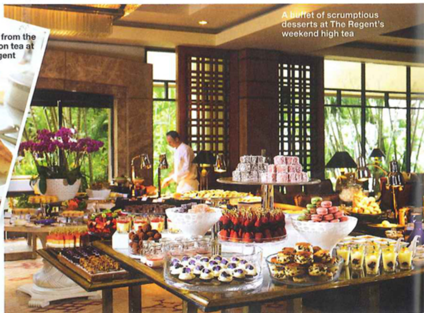
A buffet of scrumptious desserts at The Regent's weekend high tea