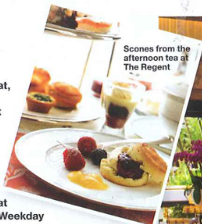
Scones from the afternoon tea at The Regent

It should come as no surprise that, with a restaurant dedicated to serving just high tea, The Regent Singapore provides an indulgent afternoon of British decadence. Take a "sip" back in time—relax in the elegant décor of the Tea Lounge in luxurious sofas or at beautiful tables as waiters serve one delectable treat after another. The wide-ranging Weekday Afternoon Tea menu offers a scrumptious assortment of finger sandwiches, home-baked scones, savoury delights, pastries and cakes, all with a free flow of freshly brewed fine English teas and coffee. And to escape the weekend urban hustle and bustle, why not indulge in The Regent's weekend High Tea buffet, a delicious spread of British, Japanese and local favourites—just what Saturdays and Sundays were made for. Visit www.fourseasons.com